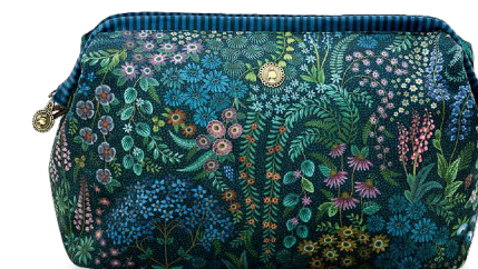
NEW | 51.274.258 Cooper Cosmetic Purse Extra Large 30x13.8x20.7 cm Querida Velvet Dark Blue - 60% Polyester Velvet - 40% PVC Compartment: 1 - Pockets: 3 - Ltr: 6 - 1/16