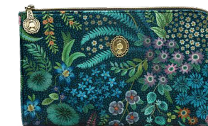
NEW | 51.274.262 Cloe Cosmetic Zipper Pouch 21x3.5x12x5 cm Querida Velvet Dark Blue - 60% Polyester Velvet - 40% PVC Compartment: 1 - Pocket: 1 - Ltr: 0.1 - 1/64