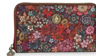
51.273.354 Wallet 18x3x11 cm Tutti i Fiori Red - 50% Polyester - 40% PVC - 10% PU Compartment: 1 - Pockets: 5 - Fits 5 cards - 1/60