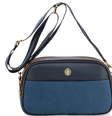
51.273.371 Frida Cross Body Bag Medium 26.5x7.5x16.5 cm Blue - 40% PU - 30% PVC - 30% Polyester Compartments: 2 - Pockets: 2 - Ltr: 2.5 Detachable strap - Fits 6 cards - 1/16