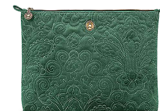
51.274.176 Cosmetic Flat Pouch Large 30x1x22 cm Velvet Quilted Green - 60% Polyester Velvet - 40% PVC Compartment: 1 - Pocket: 1 - Ltr: 0.4 - 1/60