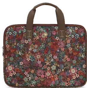
NEW | 51.273.398 Olivia Laptop Sleeve 40x2.5x30 cm Tutti i Fiori Red - 60% PVC - 30% Polyester - 10% PU Compartment: 1 - Pockets: 2 - Ltr: 1 - 1/24 Fits up to 16 inch laptop