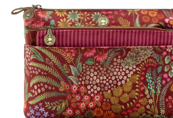
NEW | 51.274.253 Caryn Cosmetic Bag Combi 26x7.5x18cm/22x1x13 cm Querida Velvet Red - 60% Polyester Velvet - 40% PVC Compartments: 2 - Pockets: 2 - Ltr: 1.5 - 1/12