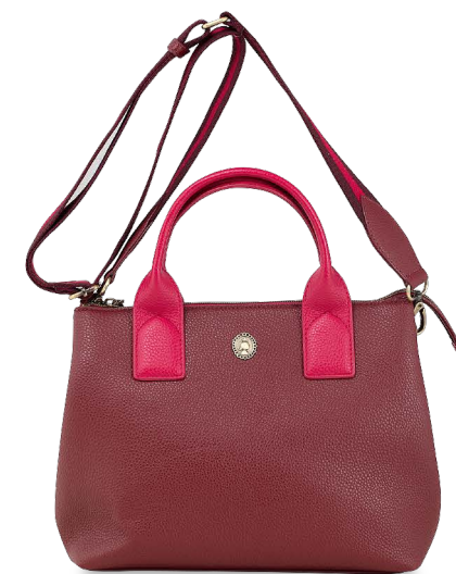
NEW | 51.273.401 Fia Shoulder Bag Medium 26.5x14x22 cm Red - 50% PU - 50% Polyester - Compartment: 1 Pockets: 4 - Ltr: 6 - Detachable strap - 1/12