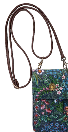
NEW | 51.273.405 Peggy Phone Bag 11x1x18 cm Querida Dark Blue - 100% PU - Compartment: 1 Pocket: 1 - Ltr: 0.1 - Detachable strap - 1/48