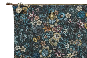
51.274.233 Charly Cosmetic Flat Pouch Medium 24x1x15.5 cm - Tutti i Fiori Blue 60% Polyester - 40% PVC Compartment: 1 - Pocket: 1 - Ltr: 0.3 - 1/48