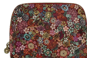
51.274.240 Coby Cosmetic Bag Triangle Medium 24/17x8x16.5 cm - Tutti i Fiori Red 60% Polyester - 40% PVC Compartment: 1 - Pockets: 3 - Ltr: 1.2 - 1/24