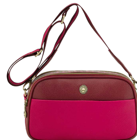
51.273.380 Frida Cross Body Bag Medium 26.5x7.5x16.5 cm Red - 40% PU - 30% PVC - 30% Polyester Compartments: 2 - Pockets: 2 - Ltr: 2.5 Detachable strap - Fits 6 cards - 1/16