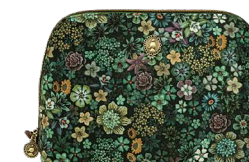
51.274.248 Coby Cosmetic Bag Triangle Medium 24/17x8x16.5 cm Tutti i Fiori Green - 60% Polyester - 40% PVC Compartment: 1 - Pockets: 3 - Ltr: 1.2 - 1/24