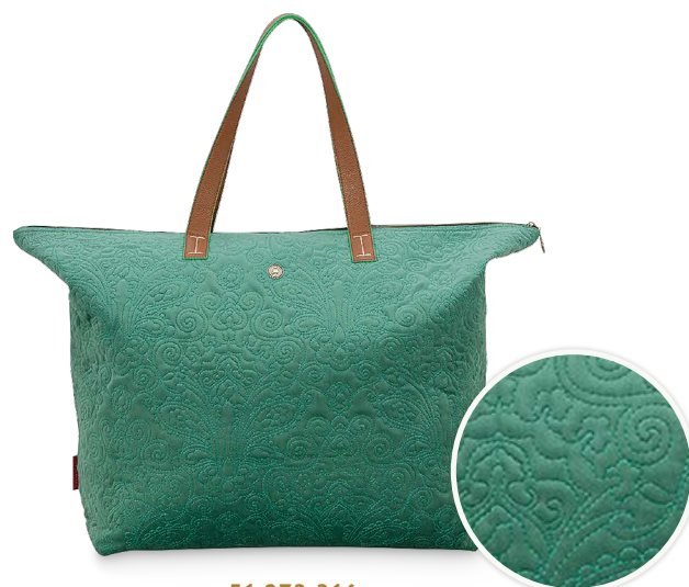
51.273.316 Tote Bag 66x20x44 cm - Velvet Quiltey Days Green 60% Polyester Velvet - 30% PVC - 10% PU Compartment: 1 - Pockets: 3 - Ltr: 17 - 1/24