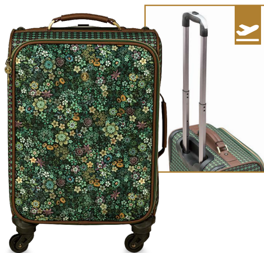
51.273.394 Tosca Trolley 35x22x47 cm - Tutti i Fiori Green 60% Polyester - 30% PVC - 10% PU Compartment: 1 - Pockets: 3 - Ltr: 24 - 1/1 Cabin Size Spinner