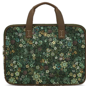
NEW | 51.273.400 Olivia Laptop Sleeve 40x2.5x30 cm - Tutti i Fiori Green 60% PVC - 30% Polyester - 10% PU Compartment: 1 - Pockets: 2 - Ltr: 1 - 1/24 Fits up to 16 inch laptop