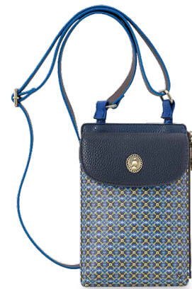
51.273.369 Pippa Phone Bag 13.5x3x20 cm Clover Blue - 40% PU - 30% PVC - 30% Polyester Compartments: 3 - Pocket: 1 - Ltr: 0.1 Fits 3 cards - 1/48