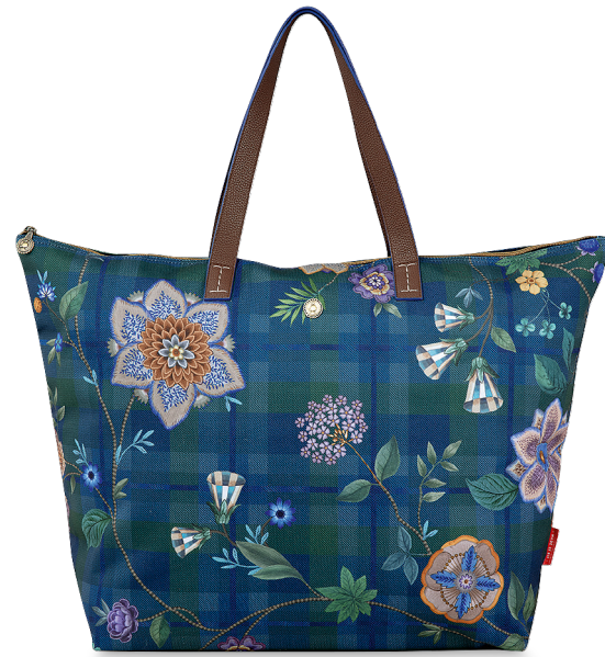
NEW | 51.275.002 Tilda Tote Bag 66x20x44 cm Flores Felices Dark Blue - 60% Polyester - 30% PVC - 10% PU Compartiment: 1 - Pockets: 3 - Ltr: 17 - 1/24