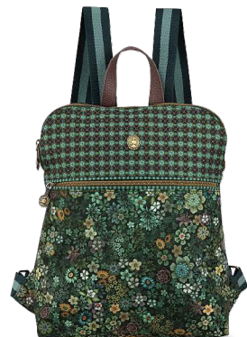
NEW | 51.273.397 Finlee Backpack 28x11x36 cm - Tutti i Fiori Green 60% PVC - 30% Polyester - 10% PU Compartments: 2 - Pockets: 2 - Ltr: 5 - 1/12