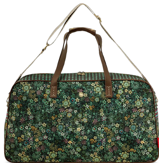
51.273.393 Tovy Weekend Bag Large 65x25.5x35 cm Tutti i Fiori Green - 60% Polyester - 30% PVC - 10% PU Compartment: 1 - Pockets: 2 - Ltr: 46 - Detachable strap - 1/12