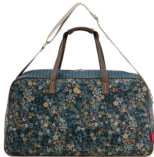
51.273.375 Tovy Weekend Bag Large 65x25.5x35 cm Tutti i Fiori Blue - 60% Polyester - 30% PVC - 10% PU Compartment: 1 - Pockets: 2 - Ltr: 46 - Detachable strap - 1/12