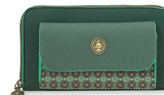
51.273.386 Wally Wallet Pocket 19.5x4.5x11 cm Green - 40% PU - 30% PVC - 30% Polyester Compartiments: 2 - Pockets: 3 Fits 16 cards - 1/60