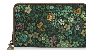
51.273.359 Wallet 18x3x11 cm - Tutti i Fiori Green 50% Polyester - 40% PVC - 10% PU Compartment: 1 - Pockets: 5 Fits 5 cards - 1/60