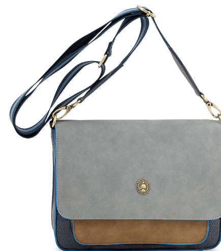
51.273.373 Fenna Cross Body Flap Medium 25x7x20 cm Blue - 50% PU - 50% Polyester Compartments: 2 - Pockets: 4 - Ltr: 2 Detachable strap - 1/12