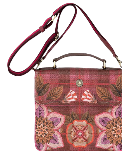
NEW | 51.273.410 Frances Cross Body Flap 25x9x21.5 cm Flores Felices Red - 50% PU - 50% Polyester Compartment: 1 - Pockets: 3 - Ltr: 4 - Detachable strap - 1/12