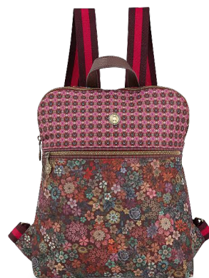
NEW | 51.273.395 Finlee Backpack 28x11x36 cm Tutti i Fiori Red - 60% PVC - 30% Polyester - 10% PU Compartments: 2 - Pockets: 2 - Ltr: 5 - 1/12