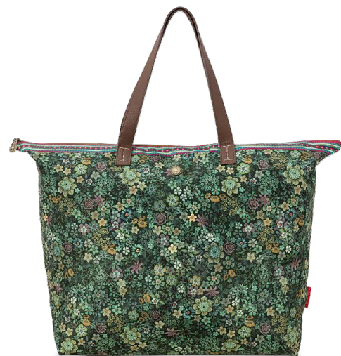
51.273.363 Tote Bag 66x20x44 cm - Tutti i Fiori Green 60% Polyester - 30% PVC - 10% PU Compartment: 1 - Pockets: 3 - Ltr: 17 - 1/24