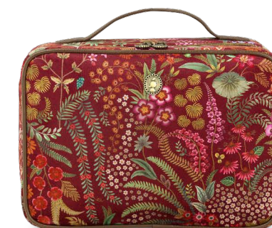
NEW | 51.274.259 Casey Beauty Case 27x10x19 cm Querida Velvet Red - 60% Polyester Velvet - 30% PVC - 10% PU Compartments: 2 - Pockets: 2 - Ltr: 4 - 1/12