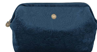
51.274.217 Cosmetic Purse Extra Large 30x13.8x20.7 cm - Velvet Quiltey Days Blue 60% Polyester Velvet - 40% PVC Compartment: 1 - Pockets: 3 - Ltr: 6 - 1/16