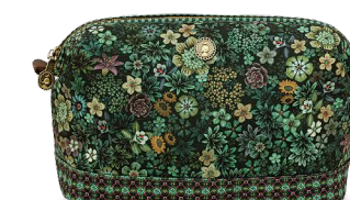
51.274.250 Cooper Cosmetic Purse Large 26x12x18 cm Tutti i Fiori Green - 60% Polyester - 40% PVC Compartment: 1 - Pockets: 3 - Ltr: 4 - 1/24