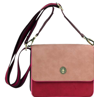
51.273.381 Fenna Cross Body Flap Small 19x6x16 cm Red - 50% PU - 50% Polyester Compartment: 1 - Pockets: 2 - Ltr: 1.3 Detachable strap - 1/24