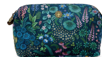
NEW | 51.274.256 Cooper Cosmetic Purse Medium 22.5x9.5x15 cm Querida Velvet Dark Blue - 60% Polyester Velvet - 40% PVC Compartment: 1 - Pockets: 2 - Ltr: 2.3 - 1/36