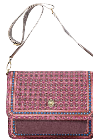
51.273.351 Cross Body Flap 25x7x20 cm Clover Pink - 60% PVC - 30% Polyester - 10% PU Compartments: 2 - Pockets: 4 - Ltr: 2 Detachable strap - 1/12