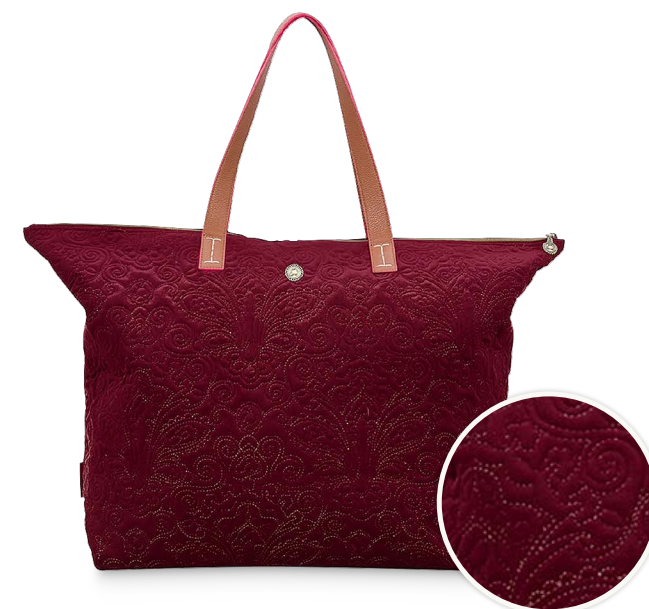
51.273.315 Tote Bag 66x20x44 cm - Velvet Quiltey Days Red 60% Polyester Velvet - 30% PVC - 10% PU Compartment: 1 - Pockets: 3 - Ltr: 17 - 1/24