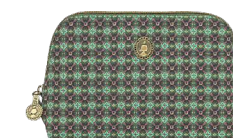
51.274.247 Coby Cosmetic Bag Triangle Small 19/15x6x12 cm Clover Green - 60% Polyester - 40% PVC Compartment: 1 - Pockets: 2 - Ltr: 0.5 - 1/36