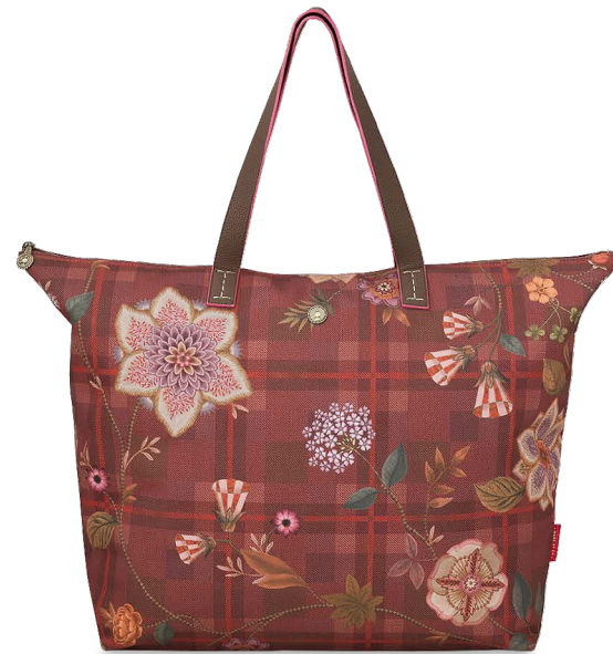
NEW | 51.275.001 Tilda Tote Bag 66x20x44 cm Flores Felices Red - 60% Polyester - 30% PVC - 10% PU Compartiment: 1 - Pockets: 3 - Ltr: 17 - 1/24