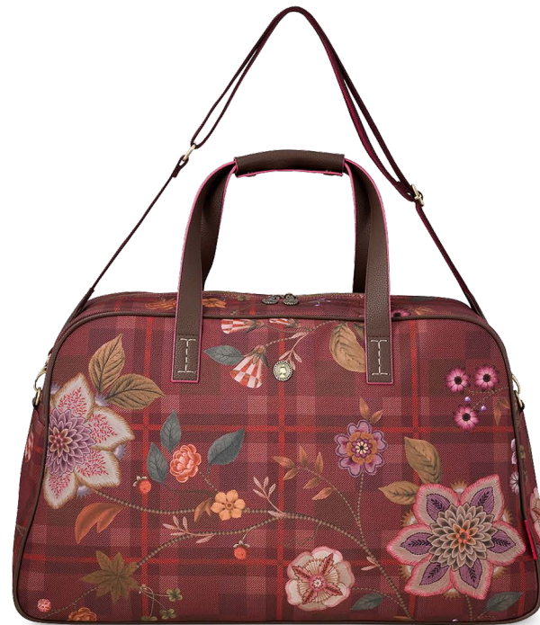
NEW | 51.275.005 Tovy Weekend Bag Medium 57x22x37 cm Flores Felices Red - 60% Polyester - 30% PVC - 10% PU Compartiment: 1 - Pockets: 2 - Ltr: 33 - Detachable strap - 1/12