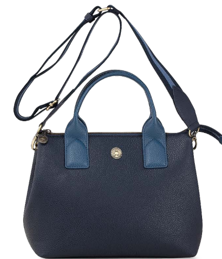
NEW | 51.273.402 Fia Shoulder Bag Medium 26.5x14x22 cm Blue - 50% PU - 50% Polyester - Compartment: 1 Pockets: 4 - Ltr: 6 - Detachable strap - 1/12