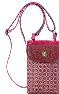
51.273.378 Pippa Phone Bag 13.5x3x20 cm Clover Pink - 40% PU - 30% PVC - 30% Polyester Compartiments: 3 - Pocket: 1 - Ltr: 0.1 Fits 3 cards - 1/48