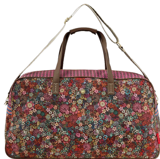
51.273.384 Tovy Weekend Bag Large 65x25.5x35 cm Tutti i Fiori Red - 60% Polyester - 30% PVC - 10% PU Compartment: 1 - Pockets: 2 - Ltr: 46 - Detachable strap - 1/12