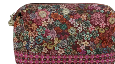
51.274.242 Cooper Cosmetic Purse Large 26x12x18 cm - Tutti i Fiori Red 60% Polyester - 40% PVC Compartment: 1 - Pockets: 3 - Ltr: 4 - 1/24