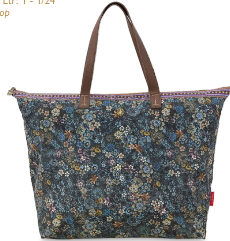
51.273.361 Tote Bag 66x20x44 cm - Tutti i Fiori Blue 60% Polyester - 30% PVC - 10% PU Compartment: 1 - Pockets: 3 - Ltr: 17 - 1/24