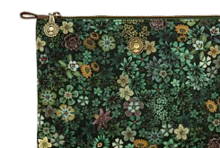
51.274.249 Charly Cosmetic Flat Pouch Medium 24x1x15.5 cm Tutti i Fiori Green - 60% Polyester - 40% PVC Compartment: 1 - Pocket: 1 - Ltr: 0.3 - 1/48