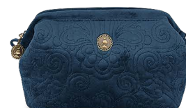
51.274.215 Cosmetic Purse Small 19x8.5x12 cm - Velvet Quiltey Days Blue 60% Polyester Velvet - 40% PVC Compartment: 1 - Pockets: 2 - Ltr: 1 - 1/36