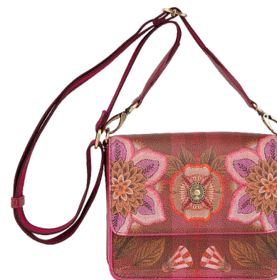
NEW | 51.273.408 Fenna Cross Body Flap Small 19x6x16 cm Flores Felices Red - 50% PU - 50% Polyester Compartment: 1 - Pockets: 2 - Ltr: 1.3 - Detachable strap - 1/24