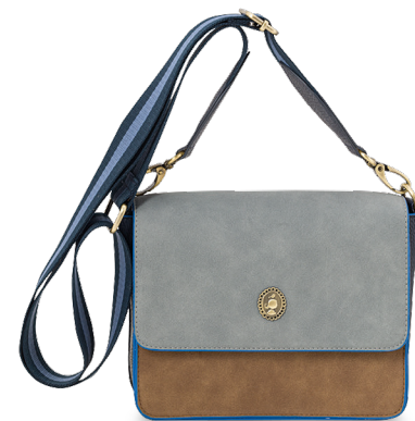
51.273.372 Fenna Cross Body Flap Small 19x6x16 cm Blue - 50% PU - 50% Polyester Compartment: 1 - Pockets: 2 - Ltr: 1.3 Detachable strap - 1/24