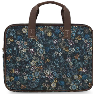
NEW | 51.273.399 Olivia Laptop Sleeve 40x2.5x30 cm Tutti i Fiori Blue - 60% PVC - 30% Polyester - 10% PU Compartment: 1 - Pockets: 2 - Ltr: 1 - 1/24 Fits up to 16 inch laptop