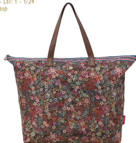
51.273.362 Tote Bag 66x20x44 cm - Tutti i Fiori Red 60% Polyester - 30% PVC - 10% PU Compartment: 1 - Pockets: 3 - Ltr: 17 - 1/24