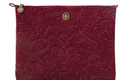
51.274.191 Cosmetic Flat Pouch Large 30x1x22 cm - Velvet Quiltey Days Red 60% Polyester Velvet - 40% PVC Compartment: 1 - Pocket: 1 - Ltr: 0.4 - 1/60