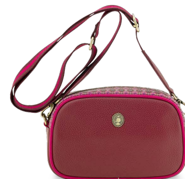
51.273.379 Frida Cross Body Bag Small 21x6x13 cm Red - 40% PU - 30% PVC - 30% Polyester Compartment: 1 - Pockets: 2 - Ltr: 1.2 Detachable strap - 1/24