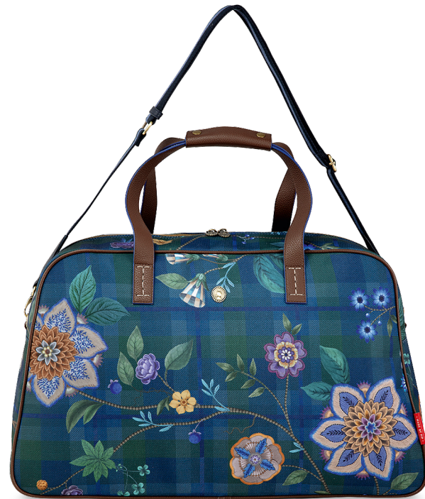
NEW | 51.275.006 Tovy Weekend Bag Medium 57x22x37 cm Flores Felices Dark Blue - 60% Polyester - 30% PVC - 10% PU Compartiment: 1 - Pockets: 2 - Ltr: 33 - Detachable strap - 1/12