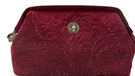
51.274.188 Cosmetic Purse Small 19x8.5x12 cm - Velvet Quiltey Days Red 60% Polyester Velvet - 40% PVC Compartment: 1 - Pockets: 2 - Ltr: 1 - 1/36