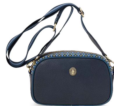
51.273.370 Frida Cross Body Bag Small 21x6x13 cm Blue - 40% PU - 30% PVC - 30% Polyester Compartment: 1 Pockets: 2 - Ltr: 1.2 Detachable strap - 1/24