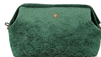
51.274.175 Cosmetic Purse Extra Large 30x13.8x20.7 cm Velvet Quilted Green - 60% Polyester Velvet - 40% PVC Compartment: 1 - Pockets: 3 - Ltr: 6 - 1/16