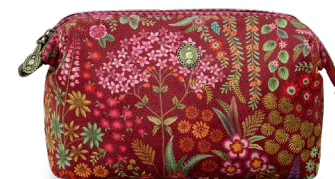
NEW | 51.274.255 Cooper Cosmetic Purse Medium 22.5x9.5x15 cm Querida Velvet Red - 60% Polyester Velvet - 40% PVC Compartment: 1 - Pockets: 2 - Ltr: 2.3 - 1/36