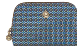
51.274.231 Coby Cosmetic Bag Triangle Small 19/15x6x12 cm - Clover Blue 60% Polyester - 40% PVC Compartment: 1 - Pockets: 2 - Ltr: 0.5 - 1/36