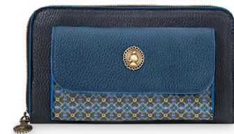
51.273.368 Wally Wallet Pocket 19.5x4.5x11 cm Blue - 40% PU - 30% PVC - 30% Polyester Compartments: 2 - Pockets: 3 Fits 16 cards - 1/60