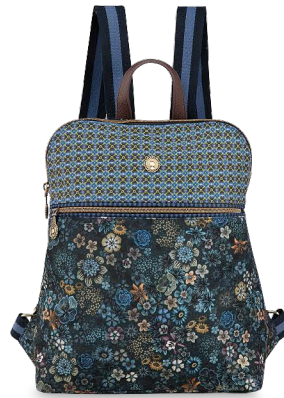
NEW | 51.273.396 Finlee Backpack 28x11x36 cm Tutti i Fiori Blue - 60% PVC - 30% Polyester - 10% PU Compartments: 2 - Pockets: 2 - Ltr: 5 - 1/12