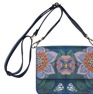
NEW | 51.273.409 Fenna Cross Body Flap Small 19x6x16 cm Flores Felices Dark Blue - 50% PU - 50% Polyester Compartment: 1 - Pockets: 2 - Ltr: 1.3 - Detachable strap - 1/24