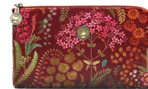
NEW | 51.274.261 Cloe Cosmetic Zipper Pouch 21x3.5x12x5 cm Querida Velvet Red - 60% Polyester Velvet - 40% PVC Compartment: 1 - Pocket: 1 - Ltr: 0.1 - 1/64