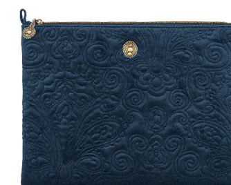
51.274.208 Cosmetic Flat Pouch Large 30x1x22 cm - Velvet Quiltey Days Blue 60% Polyester Velvet - 40% PVC Compartment: 1 - Pocket: 1 - Ltr: 0.4 - 1/60