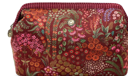
NEW | 51.274.257 Cooper Cosmetic Purse Extra Large 30x13.8x20.7 cm Querida Velvet Red - 60% Polyester Velvet - 40% PVC Compartment: 1 - Pockets: 3 - Ltr: 6 - 1/16