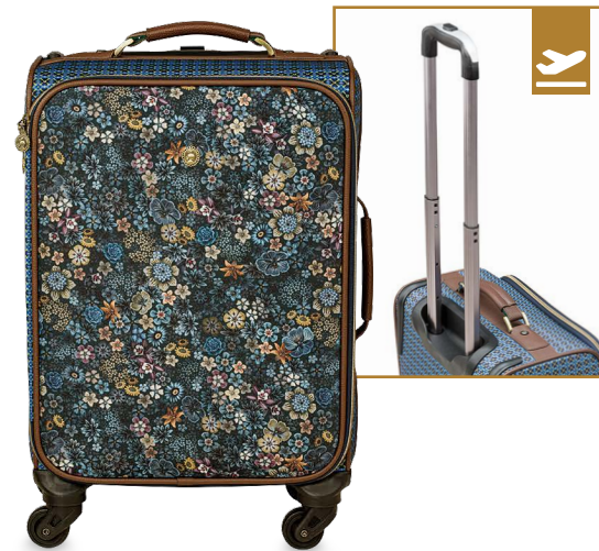
51.273.376 Tosca Trolley 35x22x47 cm - Tutti i Fiori Blue 60% Polyester - 30% PVC - 10% PU Compartment: 1 - Pockets: 3 - Ltr: 24 - 1/1 Cabin Size Spinner