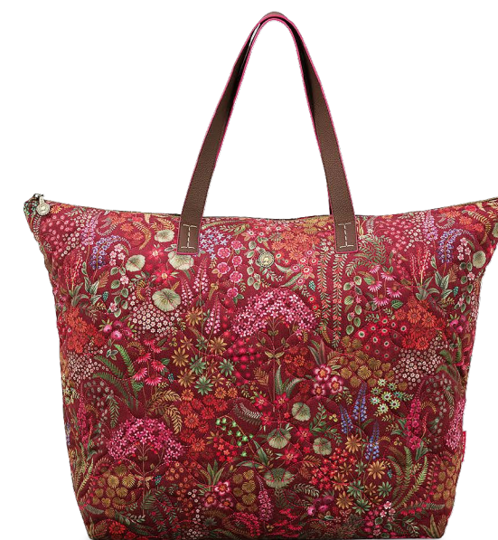
NEW | 51.275.003 Tilda Tote Bag 66x20x44 cm - Querida Quilted Velvet Red 90% Polyester Velvet - 10% PU Compartment: 1 - Pockets: 3 - Ltr: 17 - 1/24