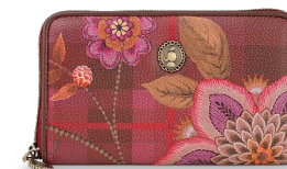
NEW | 51.273.406 Willow Wallet 18x3x11 cm Flores Felices Red - 60% PU - 20% PVC - 20% Polyester Compartment: 1 - Pockets: 5 - Fits 5 cards - 1/60