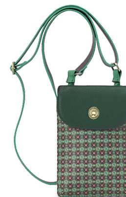
51.273.387 Pippa Phone Bag - 13.5x3x20 cm Clover Green - 40% PU - 30% PVC - 30% Polyester Compartiments: 3 - Pocket: 1 - Ltr: 0.1 Fits 3 cards - 1/48