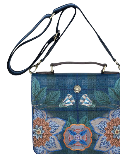
NEW | 51.273.411 Frances Cross Body Flap 25x9x21.5 cm Flores Felices Dark Blue - 50% PU - 50% Polyester Compartment: 1 - Pockets: 3 - Ltr: 4 - Detachable strap - 1/12