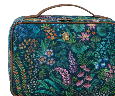
NEW | 51.274.260 Casey Beauty Case 27x10x19 cm Querida Velvet Dark Blue - 60% Polyester Velvet - 30% PVC - 10% PU Compartments: 2 - Pockets: 2 - Ltr: 4 - 1/12