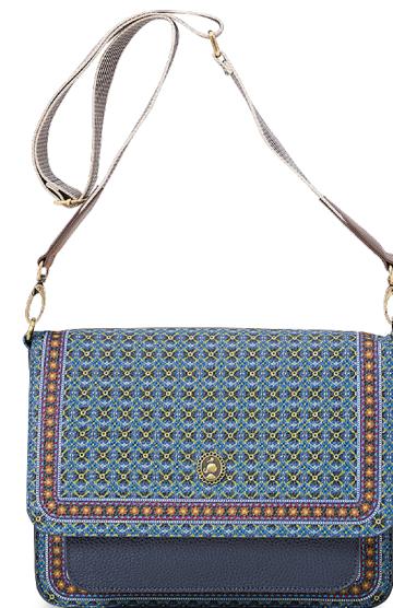
51.273.346 Cross Body Flap 25x7x20 cm Clover Blue - 60% PVC - 30% Polyester - 10% PU Compartments: 2 - Pockets: 4 - Ltr: 2 Detachable strap - 1/12