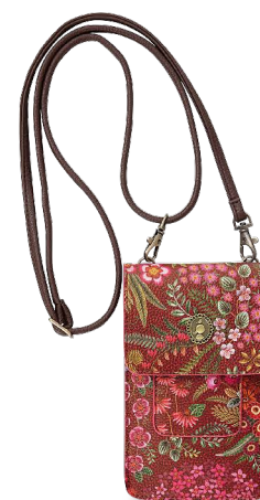
NEW | 51.273.404 Peggy Phone Bag 11x1x18 cm Querida Red - 100% PU - Compartment: 1 Pocket: 1 - Ltr: 0.1 - Detachable strap - 1/48