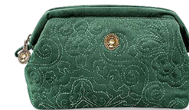
51.274.173 Cosmetic Purse Small 19x8.5x12 cm Velvet Quilted Green - 60% Polyester Velvet - 40% PVC Compartment: 1 - Pockets: 2 - Ltr: 1 - 1/36