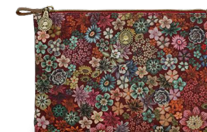
51.274.241 Charly Cosmetic Flat Pouch Medium 24x1x15.5 cm - Tutti i Fiori Red 60% Polyester - 40% PVC Compartment: 1 - Pocket: 1 - Ltr: 0.3 - 1/48