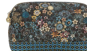
51.274.234 Cooper Cosmetic Purse Large 26x12x18 cm - Tutti i Fiori Blue 60% Polyester - 40% PVC Compartment: 1 - Pockets: 3 - Ltr: 4 - 1/24