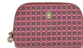
51.274.239 Coby Cosmetic Bag Triangle Small 19/15x6x12 cm - Clover Pink 60% Polyester - 40% PVC Compartment: 1 - Pockets: 2 - Ltr: 0.5 - 1/36