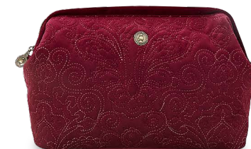
51.274.190 Cosmetic Purse Extra Large 30x13.8x20.7 cm - Velvet Quiltey Days Red 60% Polyester Velvet - 40% PVC Compartment: 1 - Pockets: 3 - Ltr: 6 - 1/16