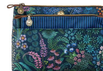
NEW | 51.274.254 Caryn Cosmetic Bag Combi 26x7.5x18cm/22x1x13 cm Querida Velvet Dark Blue - 60% Polyester Velvet - 40% PVC Compartments: 2 - Pockets: 2 - Ltr: 1.5 - 1/12