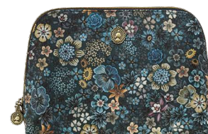
51.274.232 Coby Cosmetic Bag Triangle Medium 24/17x8x16.5 cm - Tutti i Fiori Blue 60% Polyester - 40% PVC Compartment: 1 - Pockets: 3 - Ltr: 1.2 - 1/24