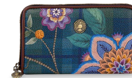
NEW | 51.273.407 Willow Wallet 18x3x11 cm Flores Felices Dark Blue - 60% PU - 20% PVC - 20% Polyester Compartment: 1 - Pockets: 5 - Fits 5 cards - 1/60