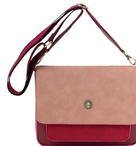
51.273.382 Fenna Cross Body Flap Medium 25x7x20 cm Red - 50% PU - 50% Polyester Compartments: 2 - Pockets: 4 - Ltr: 2 Detachable strap - 1/12