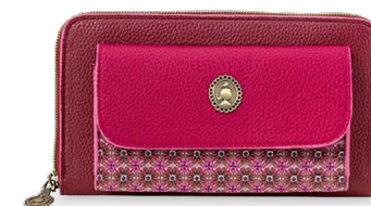
51.273.377 Wally Wallet Pocket 19.5x4.5x11 cm Red - 40% PU - 30% PVC - 30% Polyester Compartiments: 2 - Pockets: 3 Fits 16 cards - 1/60