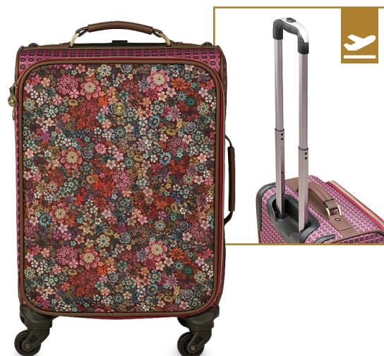
51.273.385 Tosca Trolley 35x22x47 cm - Tutti i Fiori Red 60% Polyester - 30% PVC - 10% PU Compartment: 1 - Pockets: 3 - Ltr: 24 - 1/1 Cabin Size Spinner