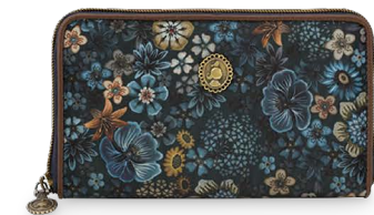
51.273.349 Wallet 18x3x11 cm - Tutti i Fiori Blue 50% Polyester - 40% PVC - 10% PU Compartment: 1 - Pockets: 5 - Fits 5 cards - 1/60